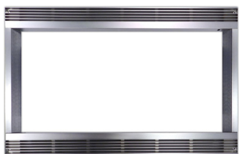
RK-48S27 / RK-48S30 RK-52S27 / RK-52S30