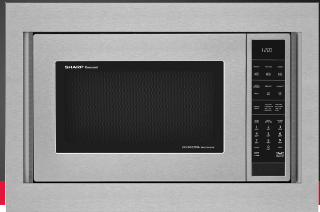
SMC1585BS Convection Microwave Oven with the RK-94S30 Trim Kit

Includes Ducts, Finish Trim, and Easy-to-Follow Instructions