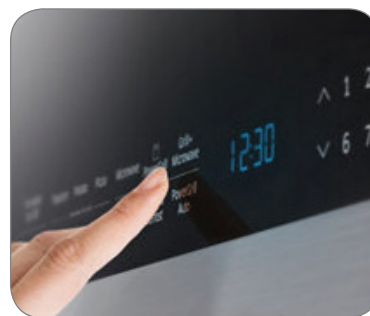
Precise Glass-Touch Controls

Fingerprint Resistant Black Stainless Steel