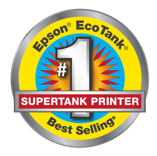
*The NPD Group, Inc., Total Channel Tracking Service, U.S. & Canada, Printers, Refillable ink tank included, based on units, August 2017 – July 2018. Supertank printers are defined as refillable ink tank printers.

1 Based on average monthly document print volumes of about 150 pages.