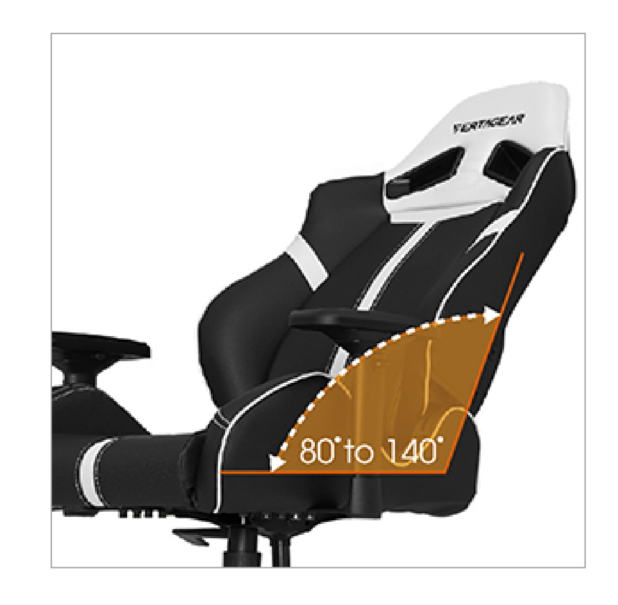
Features an independently adjustable backrest, allowing you adjust the angle of your sitting position throughout your gaming sessions (up to 140 degrees).

Having a good range of height adjustment allows you to be at an optimal level relative to your desk and PC setup. Our chairs are ergonomically designed to cater to a wide range of body shapes and height for long-lasting comfort.