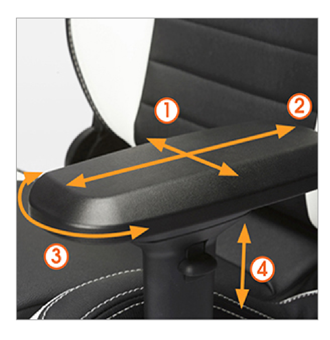
Adjustability extends to the armrests with 4 directional adjustments. The ergonomically designed armrests keep your forearms comfortable and steady regardless of body shape and