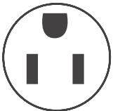
Plug Type (NEMA) 5-15P

1 Warranty 5 year sealed system/1 year full parts and labor.