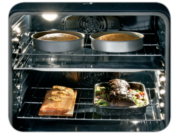
Flex Duo™ Oven